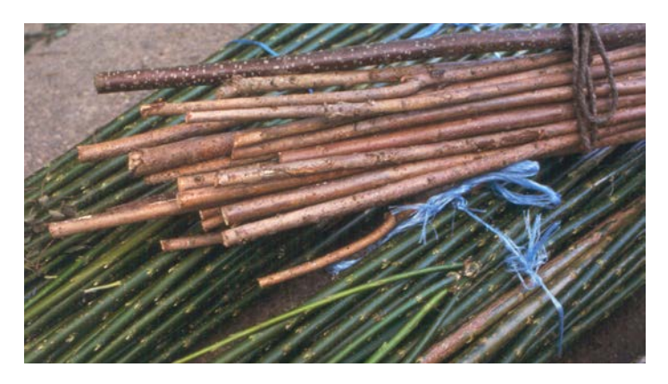
Bundles of living and dried willow whips (Salix viminalis) from a local "energy forest" await the construction process at a living willow workshop at Mårten School in Lund, Sweden.

be enhanced significantly with the assistance of design professionals and local artists. Annual maintenance on the structures, however, is generally quite straightforward and can be done by those who use them without additional professional assistance.