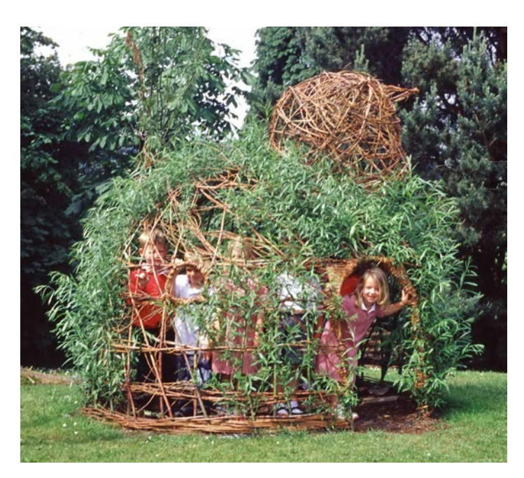
Students at Ebchester Church of England Primary School in County Durham, England, enjoy their cat-shaped playhouse.

At St. Paulinus Church of England Primary School, in Kent, England a living willow structure was built in the context of the school's extensive, wildlife habitat area. Students crawl into the "bird hide," an igloo-shaped domed structure with a long entrance tunnel, and are concealed inside while they observe birds and other wildlife that come to visit their colorful wildflower meadow and nearby pond. This structure allows the science curriculum to be tied directly to the outdoor environment and also creates an interesting place for the children to play.