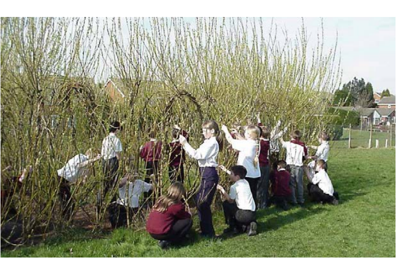
Hundreds of students at Gorsemoor County Primary School in Staffordshire, England, helped to plant a large living willow maze on school grounds.