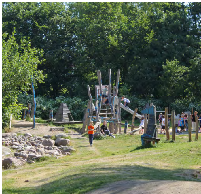
School grounds in Berlin, Germany—shown on this page and page 1—used to be asphalt deserts but transformed into leafy park-like spaces 20 years ago. Hundreds of schools across the city now absorb 100% of the rain that falls onsite, and are protected by lush tree canopies. The children and the urban environment greatly benefit from this type of design.

From an environmental perspective, paved schoolyards, which are the default in most places in California, are a problem for stormwater management and add to urban heat island effects, harming the climate. Paved school grounds don't provide any wildlife habitat and are problematic for air quality. If we can transform our paved school grounds into living schoolyards, that land will be able to act as green infrastructure and can better manage stormwater, cool urban heat islands, add valuable wildlife habitat, and improve air quality.