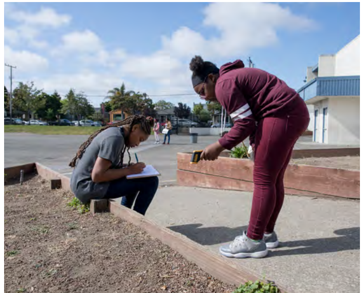
Elementary school students are working with Green Schoolyards America to measure schoolyard surface temperatures. Rubber "safety" surfaces are particularly hot.

I think we could be a world leader on schoolyard climate resilience if we set our minds—and our policies—on it, but we're very far from that goal. We have our work cut out for us, and we need everyone's help to improve this situation.