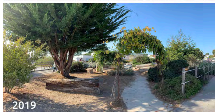
The schoolyard greening at Commodore Sloat Elementary in San Francisco, has grown and changed over the years.