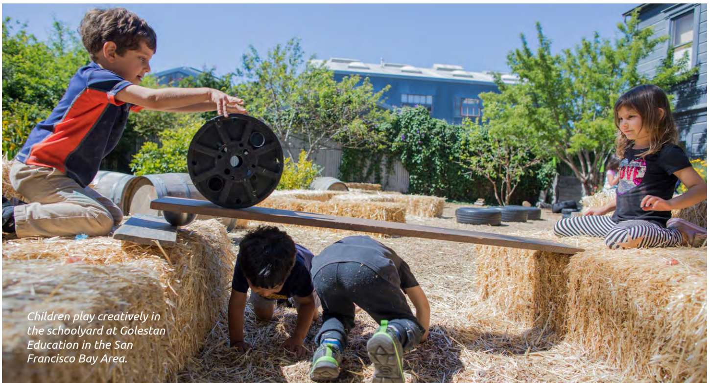
Children play creatively in the schoolyard at Golestan Education in the San Francisco Bay Area.