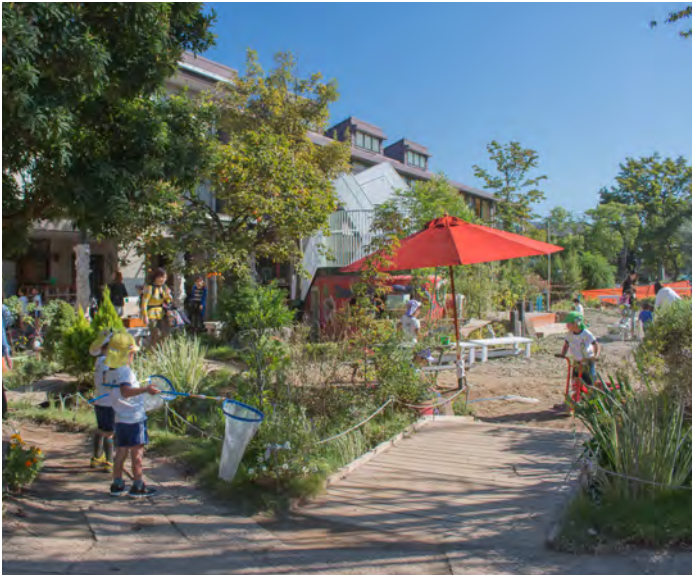
A beautifully crafted and managed preschool yard in Japan.