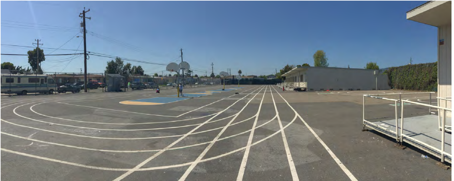
Many of California’s urban school grounds, like the ones above and below, are completely paved and don’t have trees to provide shade. This type of environment offers children and teachers very few opportunities for learning and play.

Land use in a green schoolyard is very diverse and balanced: Green schoolyards provide an “ecosystem of opportunities” that the children, the school, and the community can use to make the most of this shared public space.