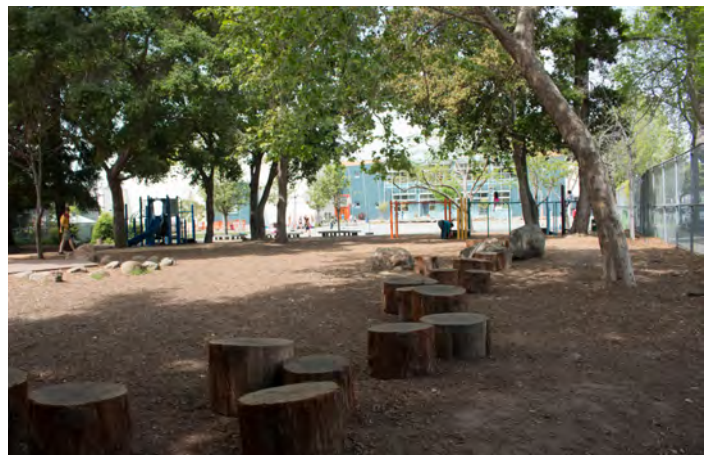
Washington Elementary School in Berkeley, CA is home to a schoolyard forest planted by children in the mid-1970s.

At the school scale, when you do invest in shifting a patch of schoolyard—say 1/4 acre—from asphalt into vegetation, costs vary depending on what you plant. If a school plants a patch of forest, they will make an initial investment to remove asphalt and plant trees, but the trees will not cost very much to maintain over time, once they are established. That's a lot different than putting in a garden on a similar scale, and then needing to employ a garden educator to teach in the garden all year, every year. Green Schoolyards America advocates for asphalt removal and tree planting as