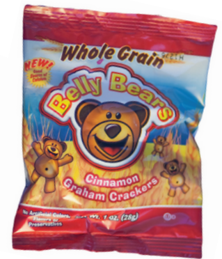
Unopened, wrapped Items